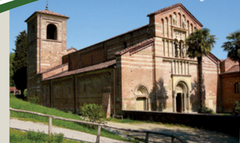
Abbey of Vezzolano, Albugnano