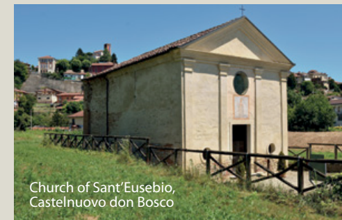
Church of Sant'Eusebio, Castelnovo don Bosco