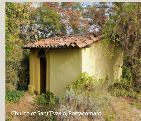
Church of Sant'Evasio, Portacomaro