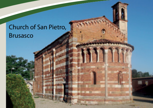
Church of San Pietro, Brusasco