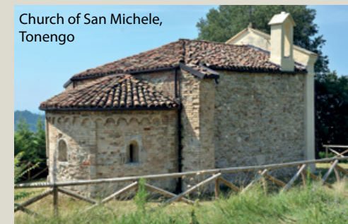
Church of San Michele, Tonengo