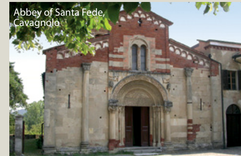
Abbey of Santa Fede, Cavagnolo