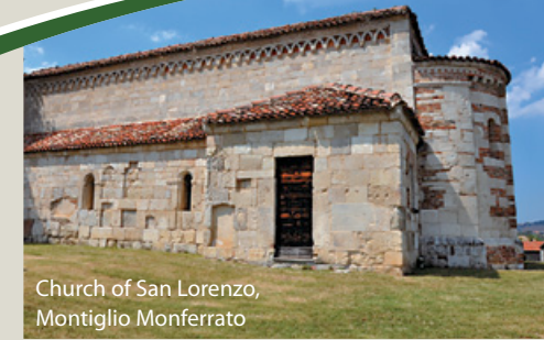
Church of San Lorenzo, Montiglio Monferrato