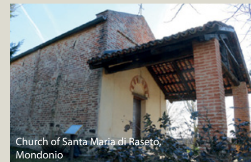
Church of Santa Maria di Raseto, Mondonio