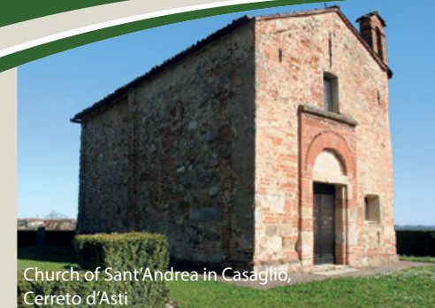
Church of Sant'Andrea in Casaglio, Cerreto d'Asti