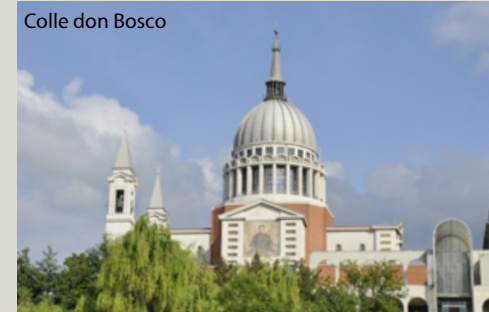
Colle don Bosco