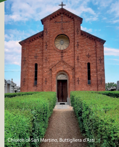
Church of San Martino, Buttigliera d'Asti