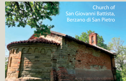
Church of San Giovanni Battista, Berzano di San Pietro