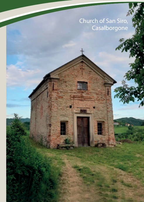
Church of San Siro, Casalborgone