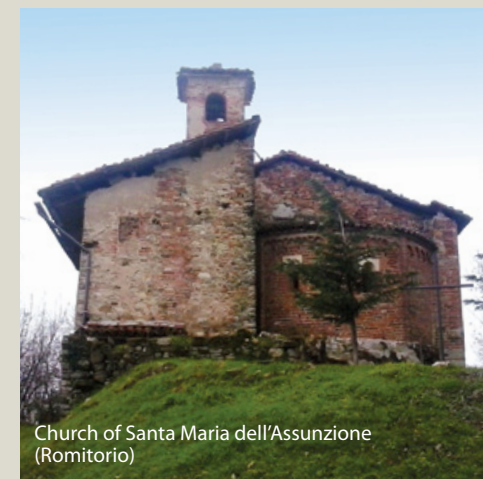
Church of Santa Maria dell'Assunzione (Romitorio)