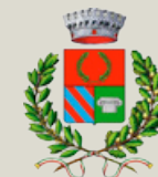
Municipality of Lauriano