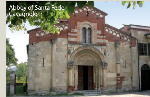
Abbey of Santa Fede, Cavagnolo