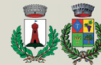
Municipality of Moransengo-Tonengo