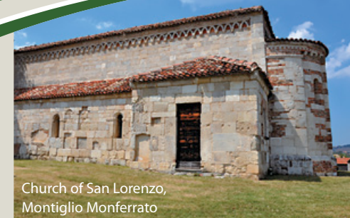
Church of San Lorenzo, Montiglio Monferrato