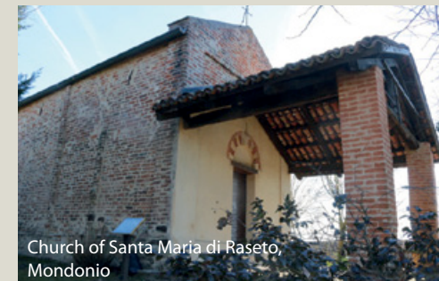
Church of Santa Maria di Raseto, Mondonio