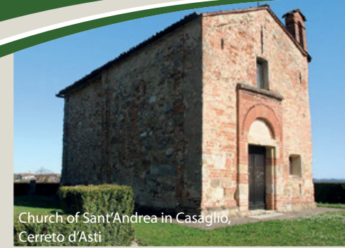
Church of Sant'Andrea in Casaglio, Cerreto d'Asti