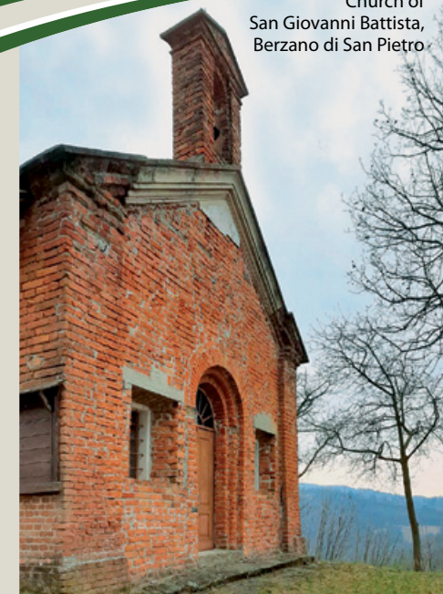
Church of San Giovanni Battista, Berzano di San Pietro