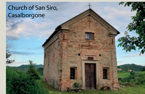
Church of San Siro, Casalborgone